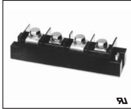
CD511225, CD511625 Dual Diode POW-R-BLOK™ Modules 250 Amperes/1200-1600 Volts